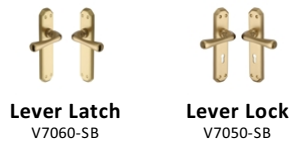
Lever Latch V7060-SB