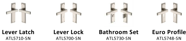
Lever Latch ATL5710-SN