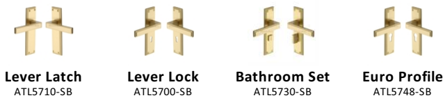
Lever Latch ATL5710-SB