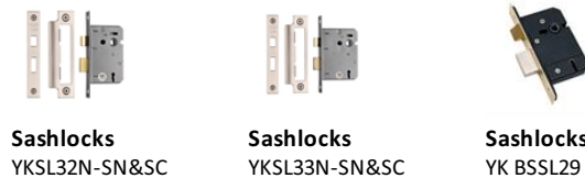
Sashlocks YKSL32N-SN&SC Sashlocks YKSL33N-SN&SC Sashlocks YK BSSL29