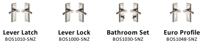
Lever Latch BOS1010-SNZ Lever Lock BOS1000-SNZ Bathroom Set BOS1030-SNZ Euro Profile BOS1048-SNZ