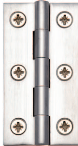
Incorporating Brass Hinge Pin